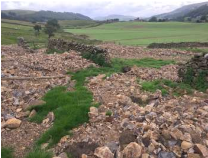
Devastation after floods

Water can be a dangerous thing, particularly when “armed” with debris. Many CJS readers will be aware of the devastation caused in North