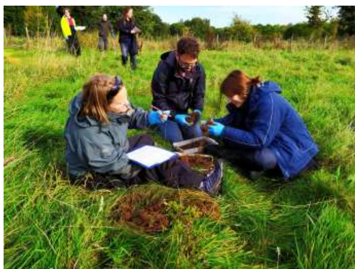
Worm search © Olga Vinduskova

In return, FSC BioLinks project volunteers have begun to give back to the biological recording community through the generation of new biological records and supporting local natural history groups and initiatives. At the beginning of 2019 London Natural History Society gained 6 new county recorders for a range of invertebrate groups. These county recorders have taken on the role of championing their chosen taxa and supporting others within London to go out and record these under-recorded groups. Typical responsibilities include organising field meetings to sites across London to record their groups, collating species records for their chosen group and submitting these to the relevant recording scheme and supporting other volunteer recorders with their identifications. Of the 6 new county recorders in London for 2019, three were volunteers trained on their respective group (true flies, centipedes and harvestmen) through the FSC BioLinks training programme.