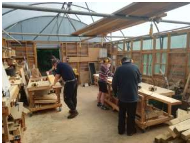
WildSkills Traineeship in Scotland (TCV)

At The Conservation Volunteers, we are pleased to announce that we have successfully secured funding through the generous and continued support from players of People's Postcode Lottery to launch a new traineeship programme in England this year.