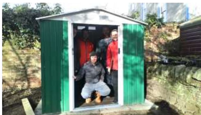
WildSkills Traineeship in Scotland (TCV)

If you fit the criteria for our new traineeship and are keen to pursue a career in the conservation sector, make sure to follow us on Twitter (@TCVtweets 3 ) to keep up to date with announcements in the coming months.