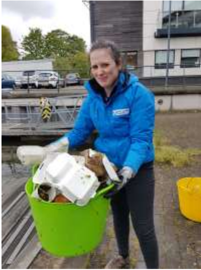
Keep Scotland Beautiful

Channelling the negative experience of being in a littered place into a positive can be difficult. However, our Clean Up Scotland campaign has been working with individuals and partners in communities across Scotland for over ten years to increase pride and make Scotland cleaner for us to enjoy, now and into the future.