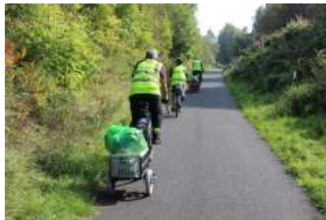
Scotland volunteers help keep the National Cycle Network clean with a litter pick as part of Spring Clean 2019

Why not make 2020 the year you help make a difference? Get in touch or visit www.keepsScotlandBeautiful.org to find out more and we'll help you to play an important part in keeping Scotland beautiful.