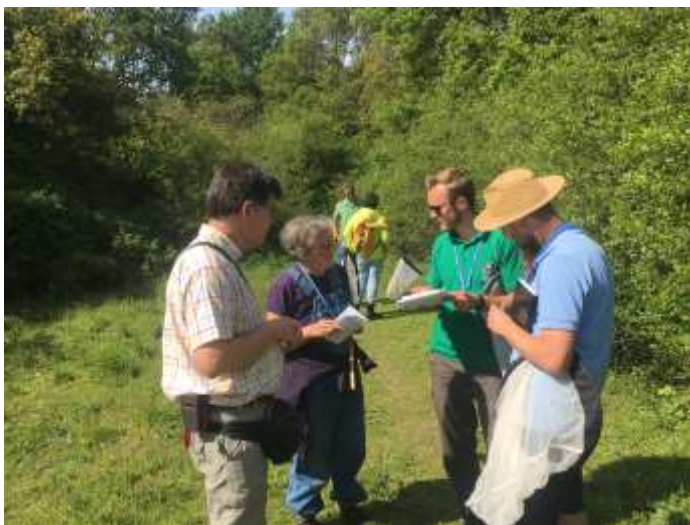
Fly fieldwork 6 (young adult)

nature and are important for evidence-based conservation.