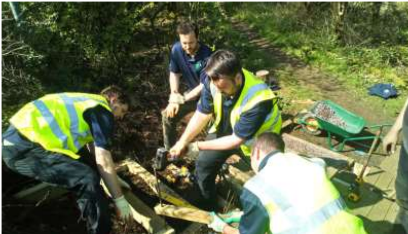
Trainees taking part in practical conservation work (TCV)

Inspiring the next generation of conservation volunteers has been something that The Conservation Volunteers have long been passionate about. In today's environmental climate, providing people with the right skills to protect and preserve the natural environment is more important than ever.