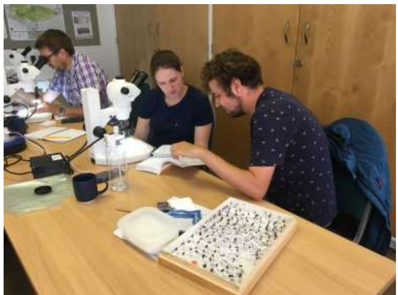
Identifying bees © Keiron Derek Brown

Over the past 2 years the project has delivered over 240 training courses and events for new and existing biological recorders in South East England and the West Midlands. Each of the events is part of a structured development programme aimed to build knowledge,