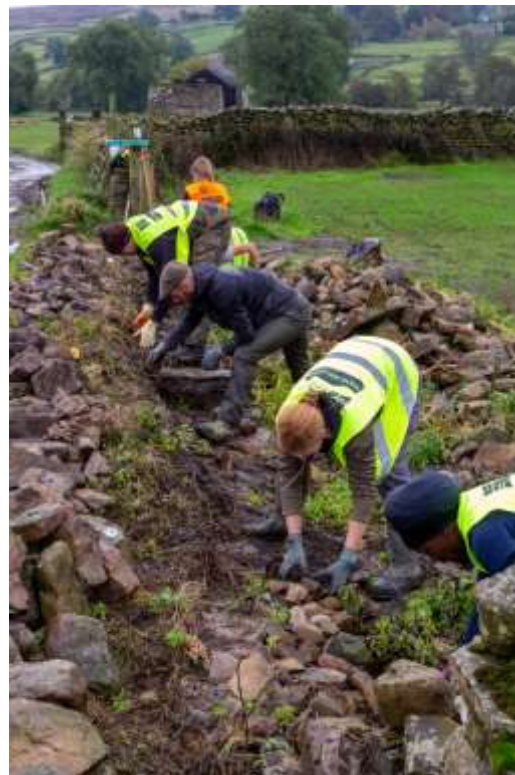
The challenge begins

So it was that on the Saturday morning an army of volunteers had arrived and registered for the Wallathon and all had been issued with high-viz jackets. As names had come in, we had been able to identify those with enough experience in walling and able to act as “team leaders” for the various sections of wall earmarked for repair. Everyone was allocated a section of wall to work on and each team consisted of a mixture of non-wallers, and people with varying levels of experience. It was encouraging to welcome a group of apprentices from the North York Moors National Park who had not long completed a training course in dry stone walling and had successfully achieved the Level 1 qualification in the craft. This was an ideal opportunity for them to put into practice their newly acquired skills.