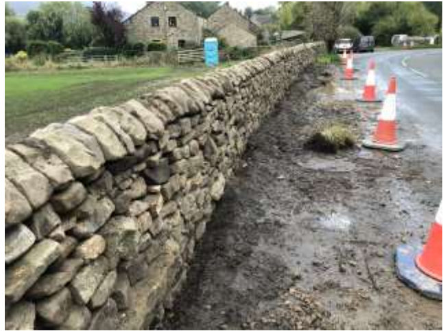
Completed section of wall