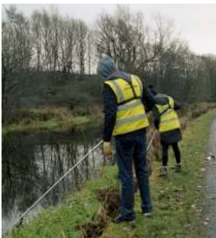
Volunteers work alongside Scottish Canals to litter pick along the Union Canal (Keep Scotland Beautiful)

3. Borrow litter-picking equipment. Your council will usually have a stock for community events. When you contact your local authority, ask what recycling options are available in the area and what procedures they would like you to follow. If you're stuck, we can loan equipment that can be collected from our offices in Stirling.