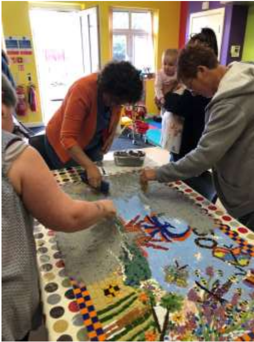
Mosaic-making at the Phoenix Centre, Rhyl (Katrina Day)

reward for their hard work! They also encourage participants with mobility difficulties to get involved, and introduce new attendees to volunteering. Our willow-weaving, felting, mosaic and wreath-making sessions were very successful. Volunteer trips have proved very enjoyable, including the north team joining forces with the south team at the Corwen allotments, and a visit to Gronant's little tern colony. Over the summer, we provided a variety of family activities and fun days, including woodland skills, camp cooking and wildlife talks, engaging local children with nature. Furthermore, our training events have provided volunteers with new skills, including hedgelaying, dry-stone walling and walk leader training.