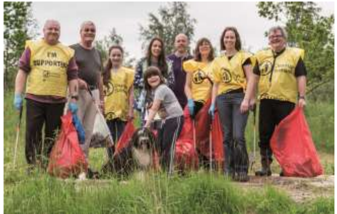
Keep Scotland Beautiful

5. Make your litter pick count. Tell us about your event and post it on the Clean Up Scotland map; this lets us know what events are happening across the country. We then use the data to showcase the breadth of community action across Scotland and demonstrate to politicians, to communities not yet involved, and to the small persistent number of people that still litter, that people do care about the quality of their local spaces and want more done to tackle our littering epidemic.