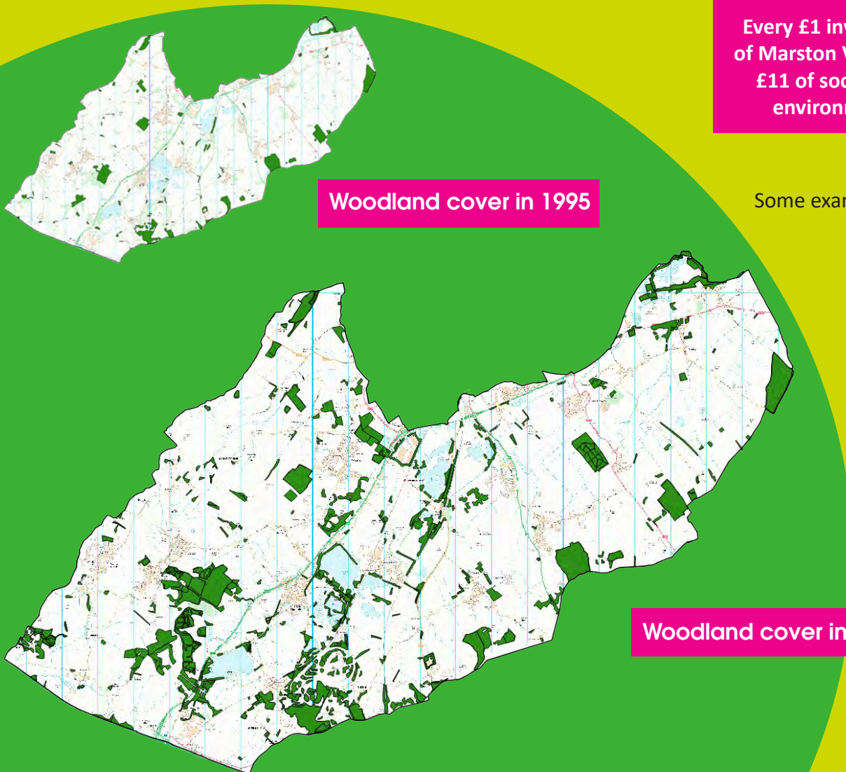
Woodland cover in 2015